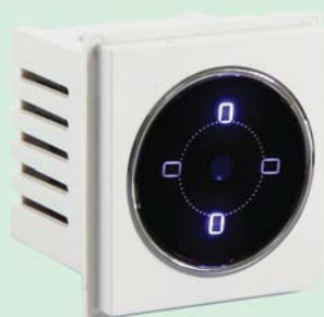
Electronic Touch Switch