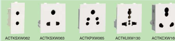
Socket as per IS 1293:1988