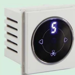
Electronic Touch Fan Regulator