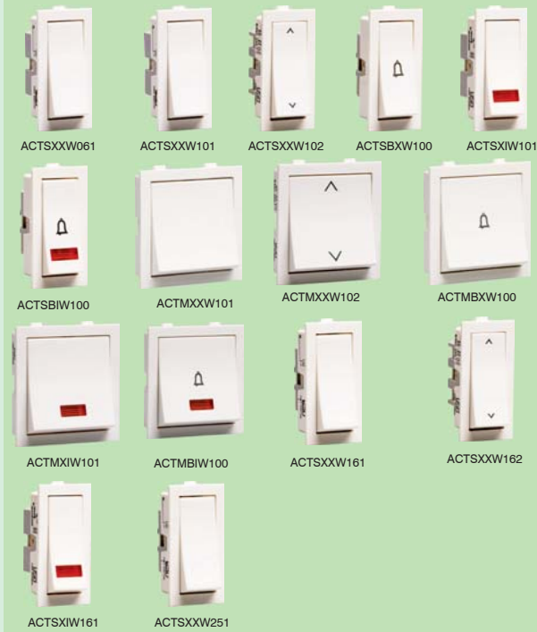
Switches as per IS 3854:1997